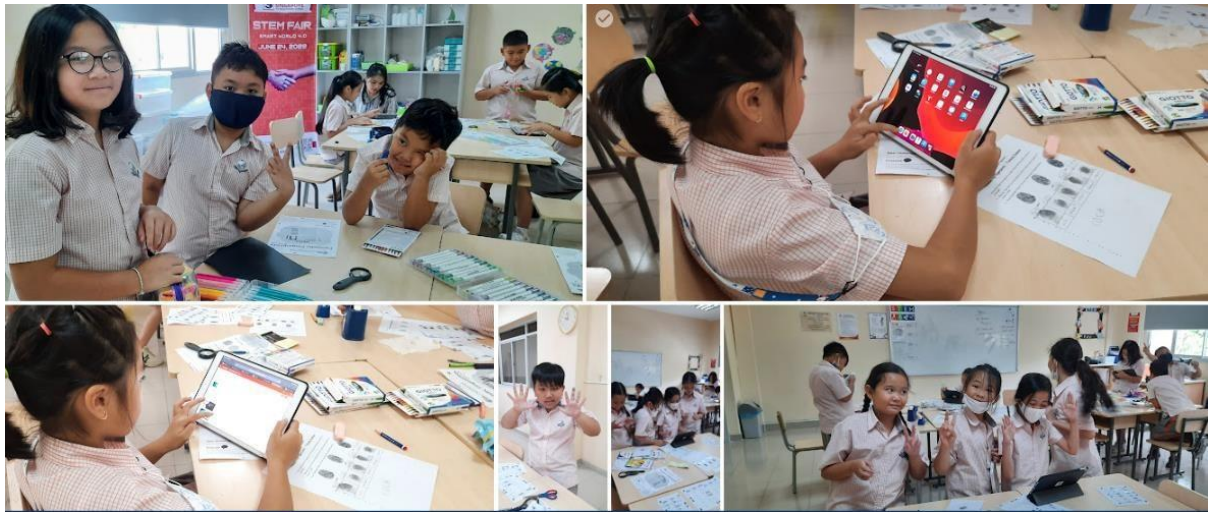
Year 4 in our STEM lab conducting Project-based CREST AWARDS investigations.