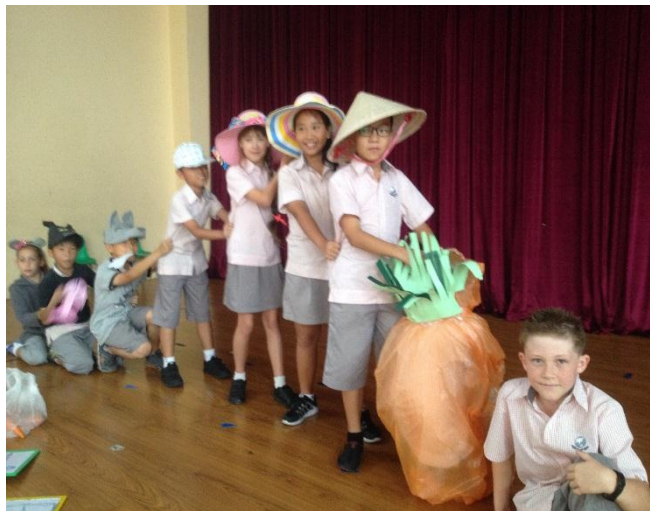
Above: Year 4L performing 'The Giant Carrot' in Assembly.