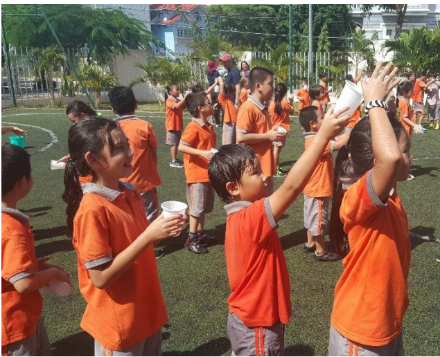
Above: Hydra showing their skills in the water game on the last day of term