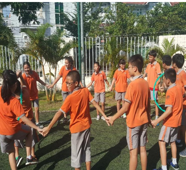
Above: The older students working on getting a hoola-hoop around the circle as fast as they can without breaking the link