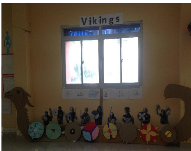
Above: Year 4L's Viking Ship that they made in Social Studies