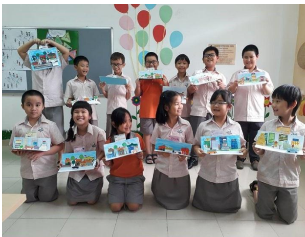
Below: Meet Year 3 Integrated with their works of Art