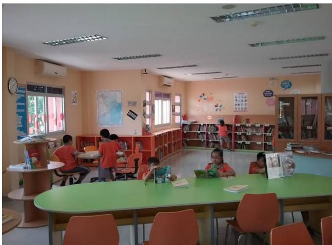
Above: Year 3G love spending time in the library reading and improving their English skills