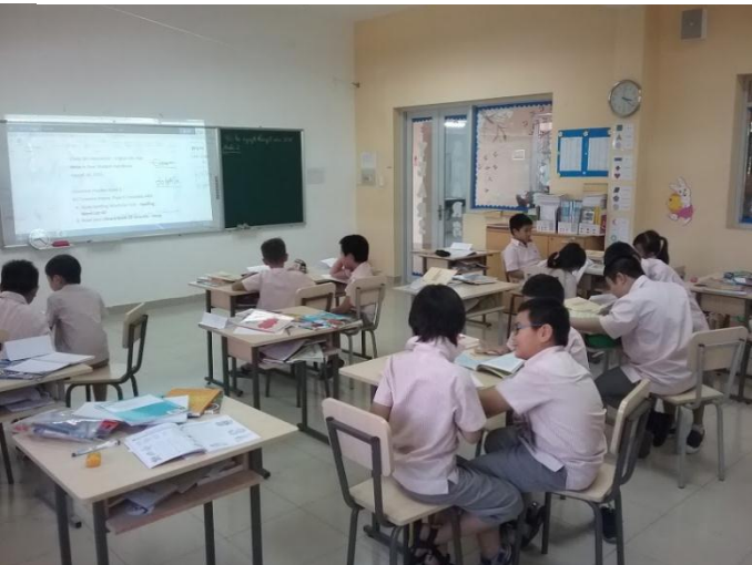
Above: Working together and learning a lot in English lessons