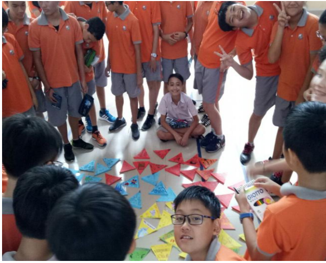
Above: Creating the flags for the bunting in the canteen on the last day of Term 1