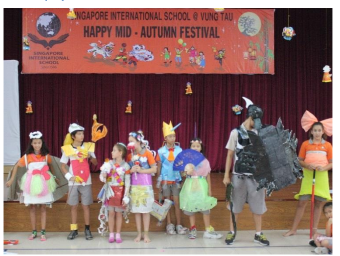
Above: Mid-Autumn Festival: Recycled Fashion Show