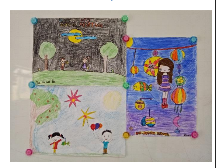
The three winning images for our Mid-Autumn Festival Drawing Competition