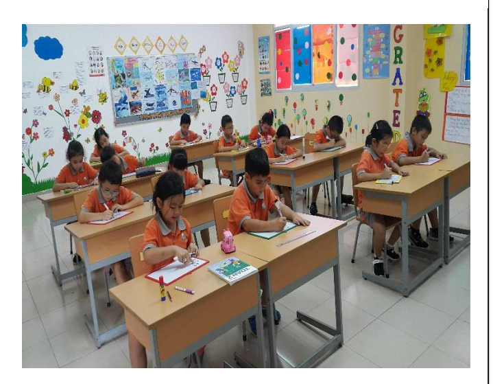
Above: The Year 2 Integrated Class is hard at work!