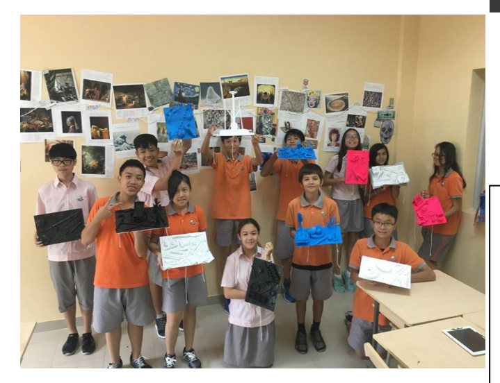
Above: Year 8L with their monochromatic found assemblages for their Art project