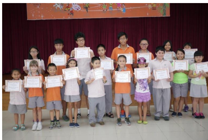
Above: October's student of the month recipients. Well done every one.