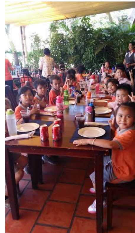
Left: After a busy morning learning about the different food types and making the pizza, the students then enjoyed a sit-down meal.