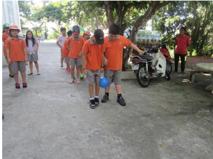
Above: The year 3 students enjoying a balloon race at the top of small mountain.