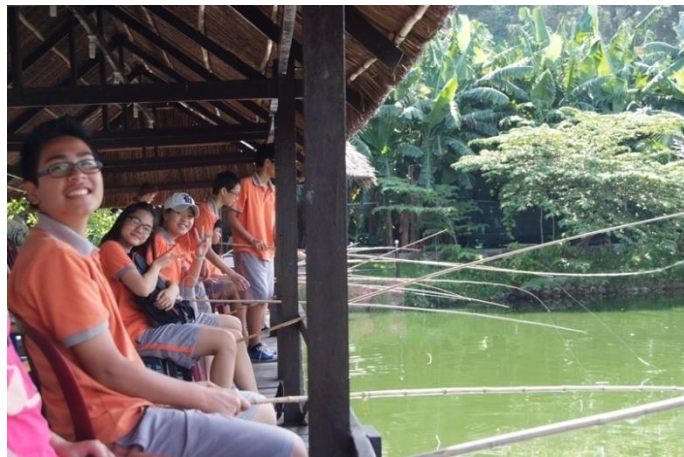
Above: Fish on! The students from IGCSE 1 enjoying a fishing trip to Hai Luc, Vung Tau.

The year 3 students went to Hai Dang Lighthouse on top of Small Mountain and discussed the wonderful panoramic view of Vung Tau. The view also gives the students a good idea of how the coast line of Vung Tau is formed. Discussions on why lighthouses were / are important, how these can be modernized and do these still form part of a need, followed. In Social Studies, students will further research the tallest, oldest and most fascinating lighthouses.