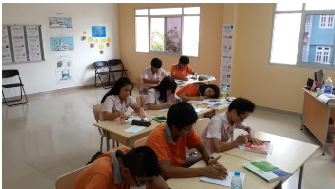
Above: The IGCSE 1 students hard at work in their Business Studies lesson.