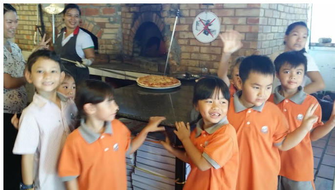
Above: Best day excursion ever! The Year 1 students went to David's Pizza to learn about the different food types found on a pizza.