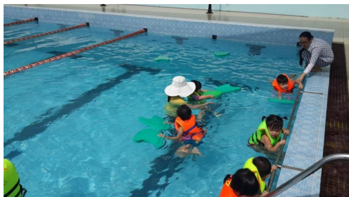
Above: Swimming is a very important skill to learn. Not only does it keep you fit but Vung Tau is by the sea and so our students can make the most of this luxury!