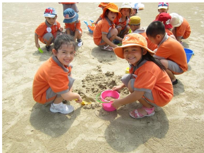
Above: Beach life. The K1 to Prep enjoying the beach and expressing their creativity by making some tremendous sand sculptures.