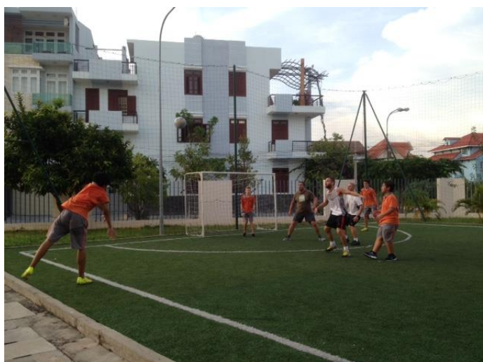
Above: The students have regular football matches against the teachers and the games are very competitive and good fun to watch.

Address: Dai An Residential Area Ward 9 Vung Tau, Ba Ria Province Vietnam