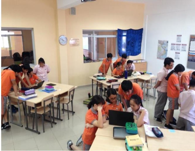
Above: Year 8 International hard at work