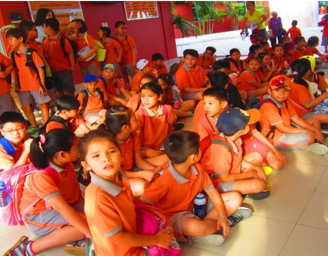
Above: Our students ready to go to Vietopia