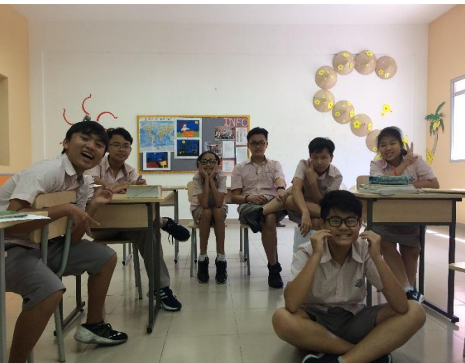
Above: The students of Year 8 and 9 Integrated