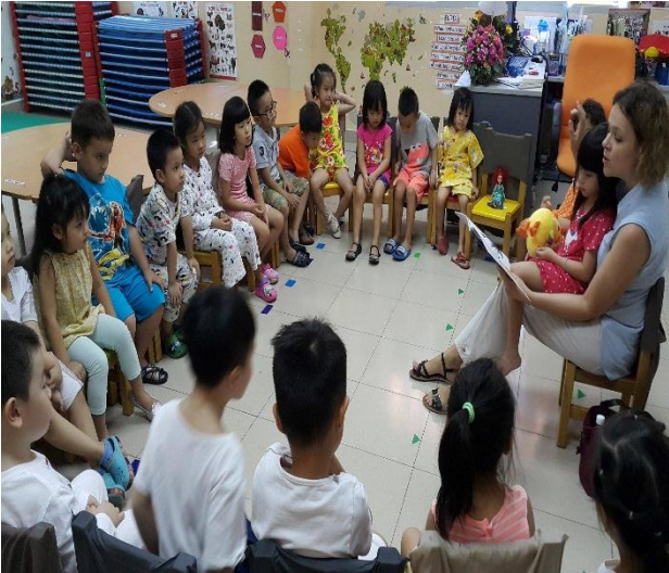
Above: One of our KIK mum's reading to some students