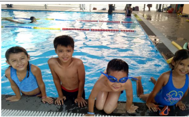
Above: Having fun in the pool is always welcomed by all students...