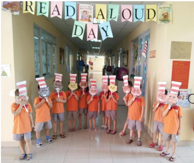
Above: Some of the students and their cats in hats