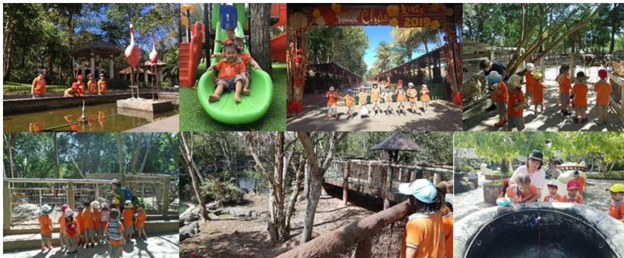
Above: KIK student excursion to Xuyen Moc

The students really explored the place with their teachers. They loved going around to see the landscape, animals, and different buildings, etc. They all had an opportunity to boil eggs in the wells and then they could eat them. It was an exciting trip and an amazing experience for our students.