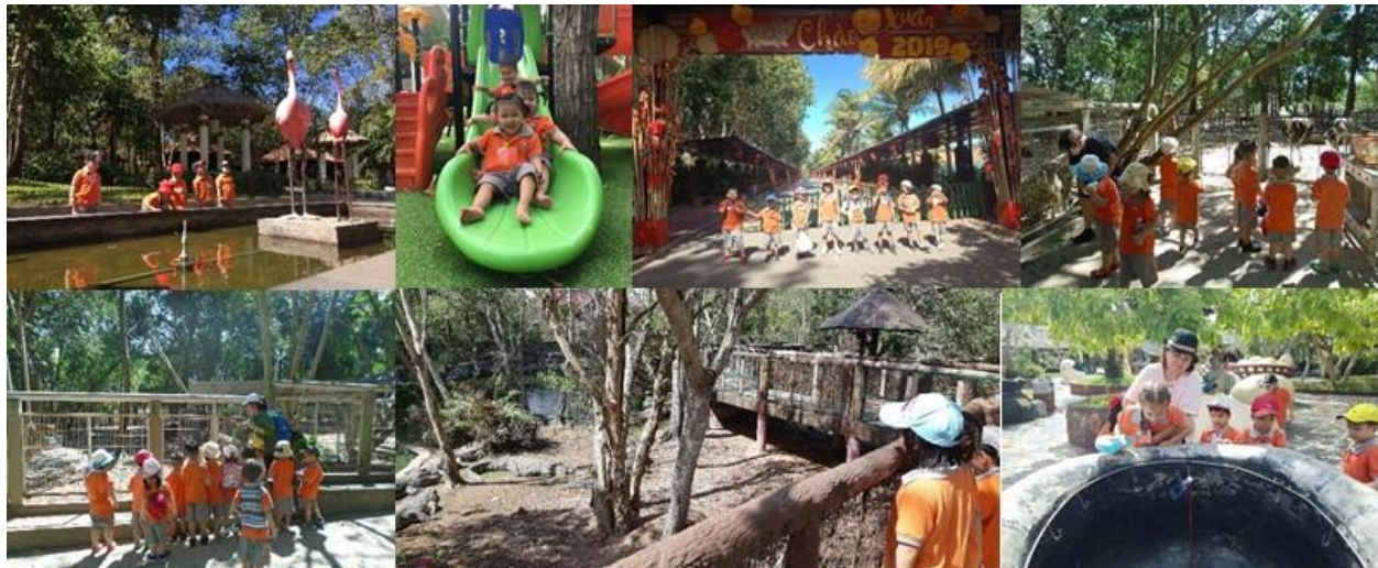
Above: KIK student excursion to Xuyen Moc

The students really explored the place with their teachers. They loved going around to see the landscape, animals, and different buildings, etc. They all had an opportunity to boil eggs in the wells and then they could eat them. It was an exciting trip and an amazing experience for our students.