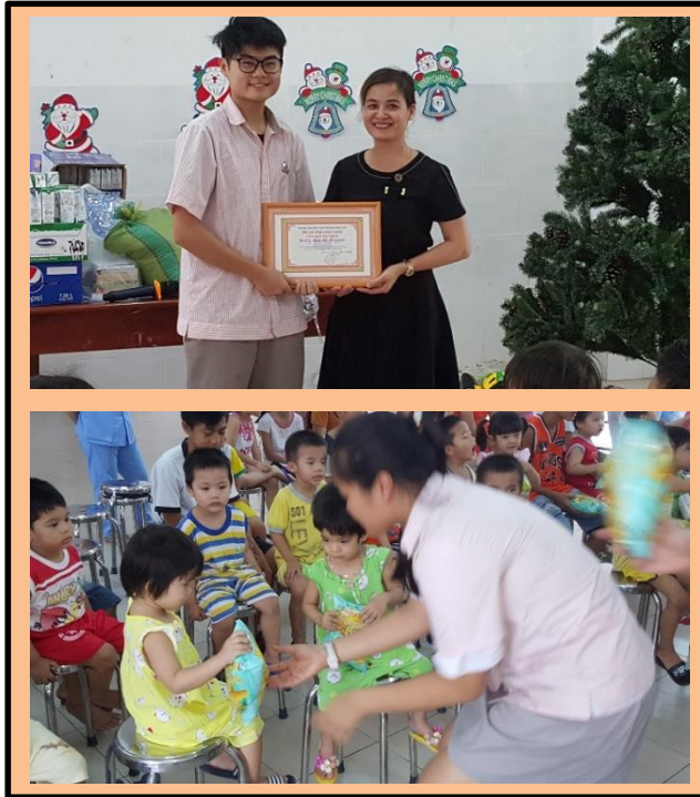
Above: IGCSE 1 & 2 Visit to Vung Tau Orphanage

On 12 December 2018, in the spirit of Christmas and giving, IGCSE 1 & 2 went to Vung Tau orphanage to donate food, clothing and some money to the centre. The students have been collecting donations throughout the year from parents and other students. This is in the spirit of Christmas and Tet where students felt that it was the right thing to extend a helping hand to the underprivileged children.