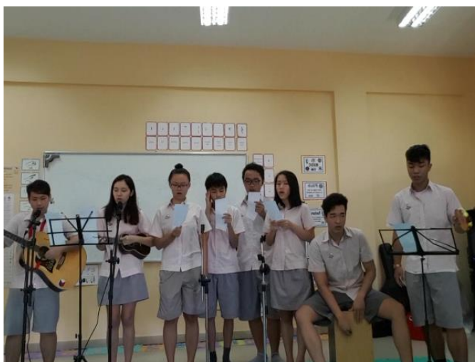
Above: iGCSE 2 practicing their song for the music show.