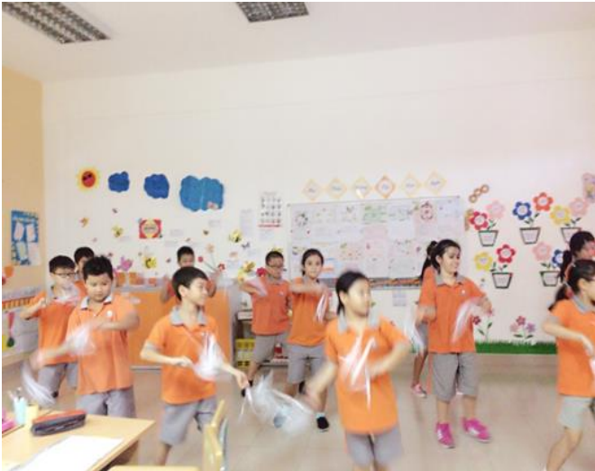
Above: Year 2 Integrated preparing for their Graduation Performance