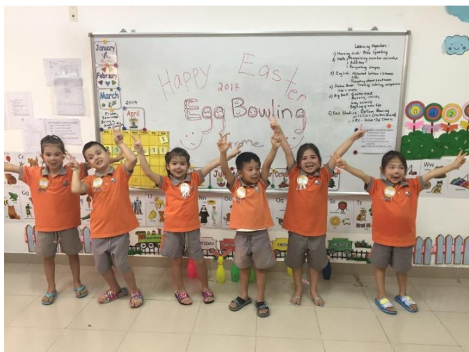
Above: Kindergarten enjoying their Easter Programme