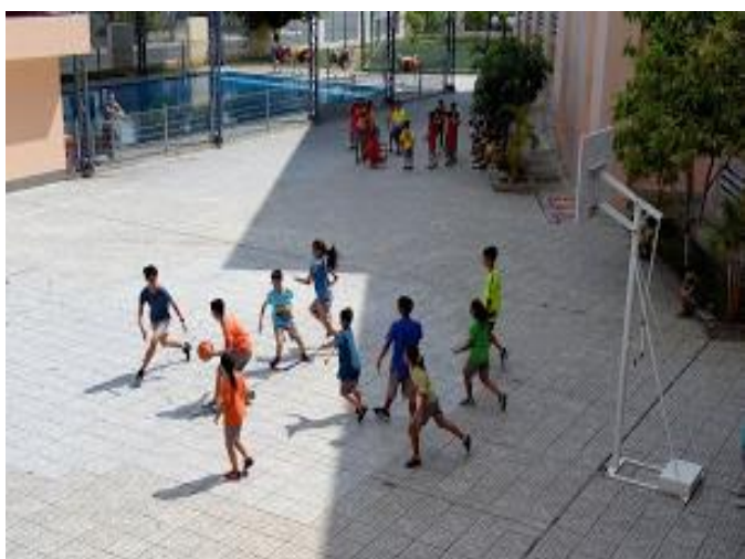
Above: Hydra vs. Dragon in Basketball