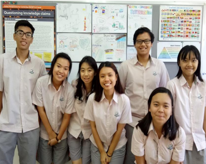
Above: iGCSE 1 Class.