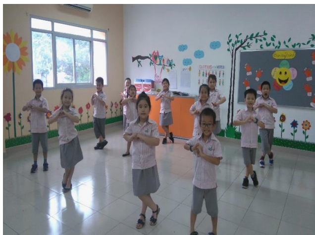
Above: Year 1 Integrated practising for their graduation performance.