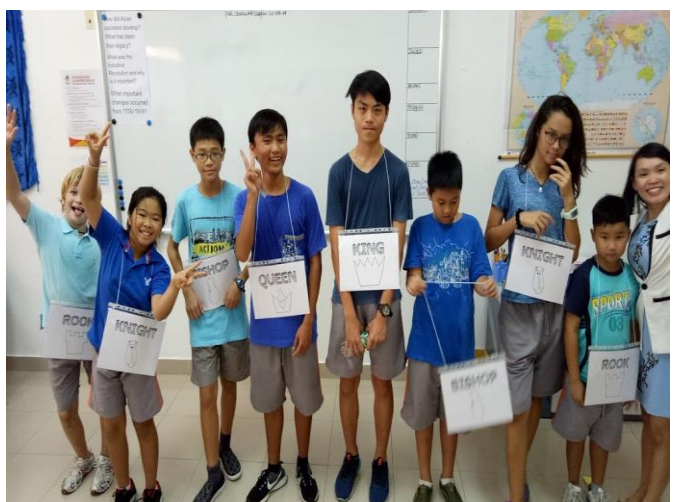
Above: Hydra ready for Human Chess