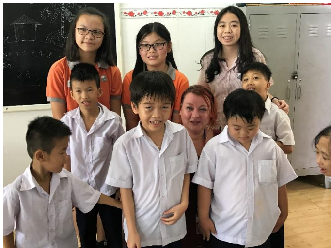
Above: Our student council visiting the orphanage to deliver our donation made at the cake sale at the end of Term 3