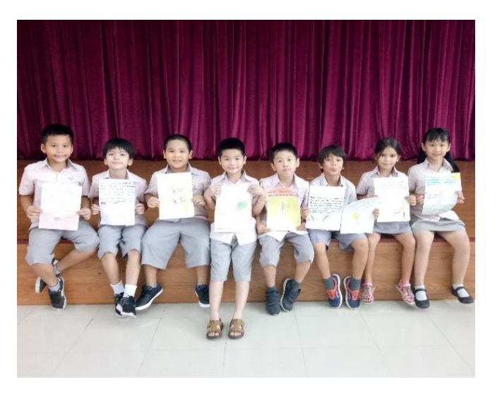
Above: The Year 1 & 2L Students after their presentation in Assembly