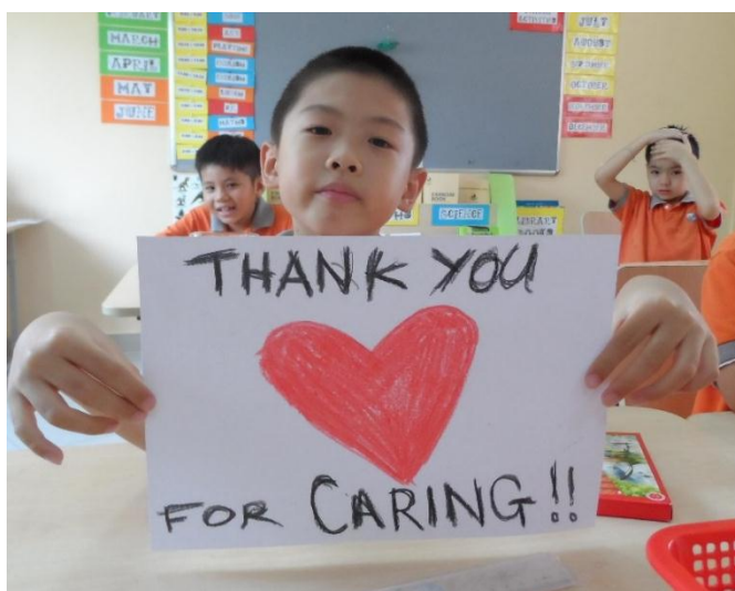
Above: An image from the Year 1&2 International Class's presentation about Caring.