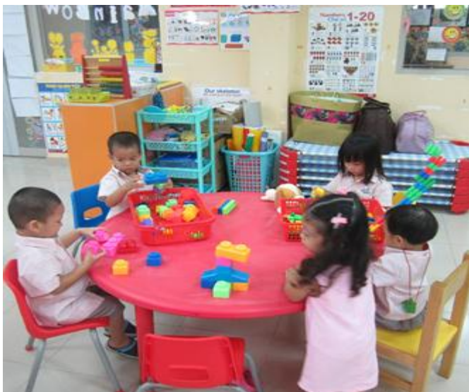
Above: A few Kindergarten students enjoying educational play