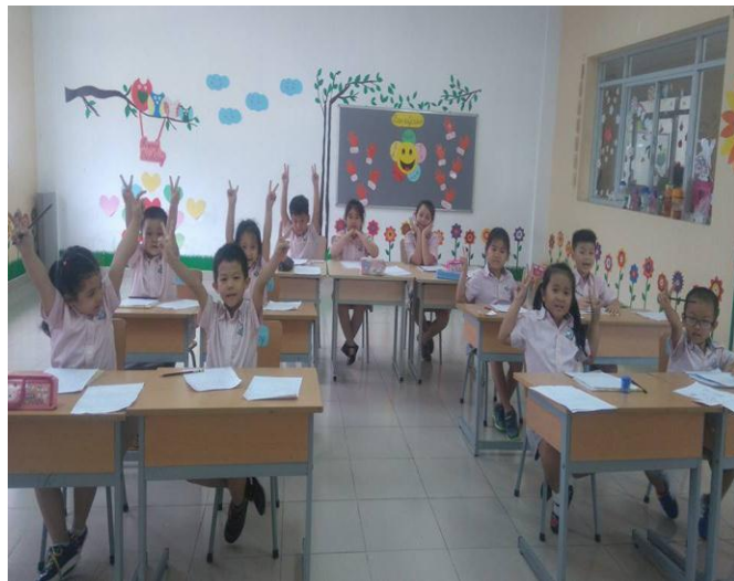
Above: The Year 1 Integrated Class is ready to learn!