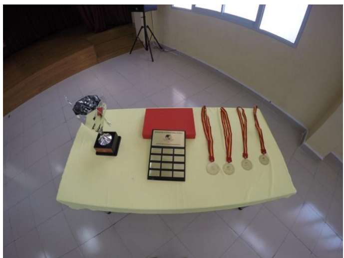
Above: The elusive trophy selection. Next year they will bring the trophy to Vung Tau.