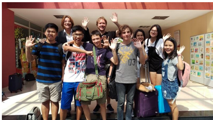
Above: We're off to Da Nang! The students travelled across the country to participate in the Business Studies competition. They were well behaved and really showed other schools how very well-mannered and socially responsible our students are.