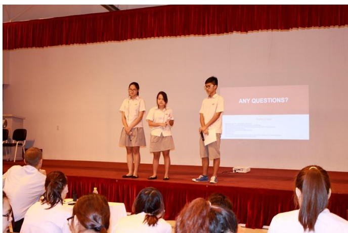
Above: The second team from SIS Vung Tau also did an amazing job and delivered an outstanding presentation. The winners this year were Da Nang and they did deserve the trophy. The students learned so much from each other, approaches and also how to conduct themselves in a competitive environment