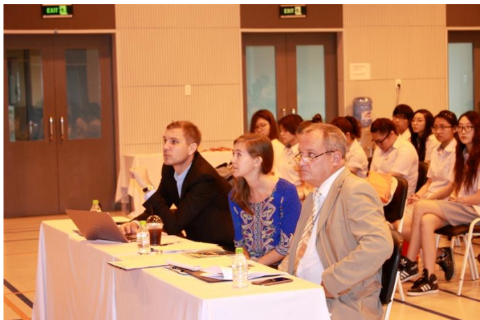
Above: The pressure from the judges at the competition was soaked up by the students. Some really tough questions were asked and they were answered professionally and efficiently.