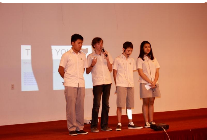
Above: Our Vung Tau students' presentation was very professional and was delivered with enthusiasm and clarity. This team came in second place!