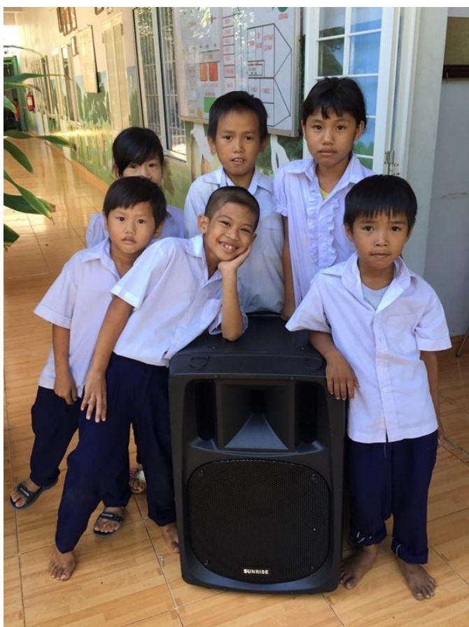
Above: The arrival of the brand new outside speaker system was welcomed by students from the local orphanage in Long Hai. The money raised from the Green Day at SIS Vung Tau paid for this much needed piece of equipment. Now the students can enjoy outside activities and classes.