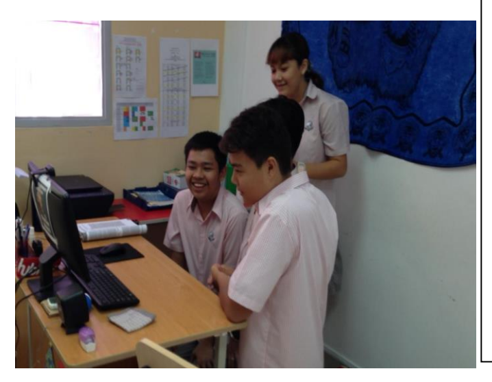
Above: IGCSE 1 students talking to girls from Frensham Girls' School in Australia

Address: Dai An Residential Area Ward 9, Vung Tau, Ba Ria - Vung Tau Province