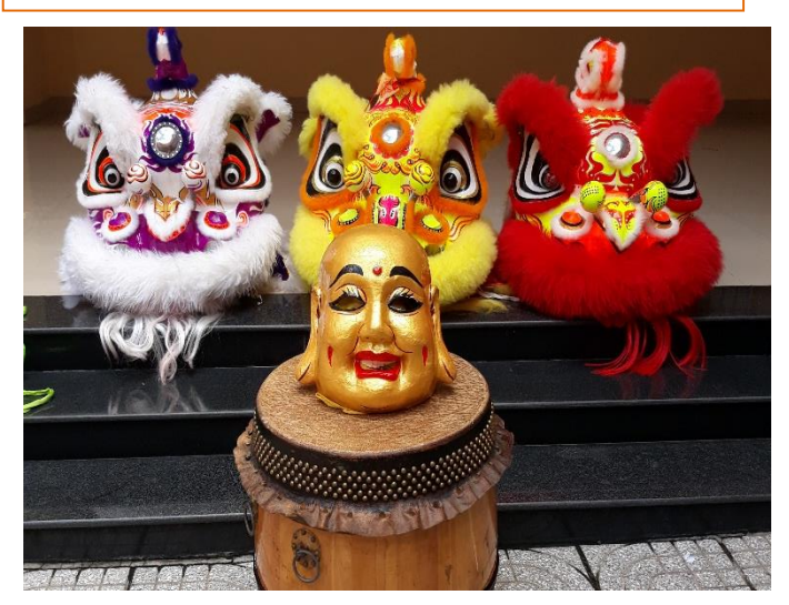
Above and Below: Celebrating Mid Autumn Festival