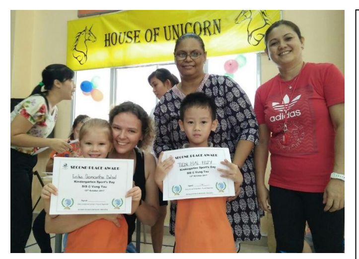
Above: Enjoying the excitement of Sports Day