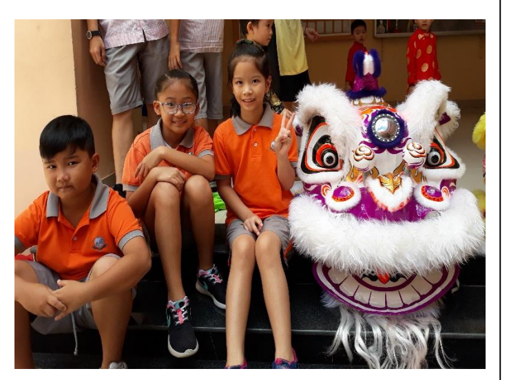
Above: Students waiting for the Lion Dance to begin