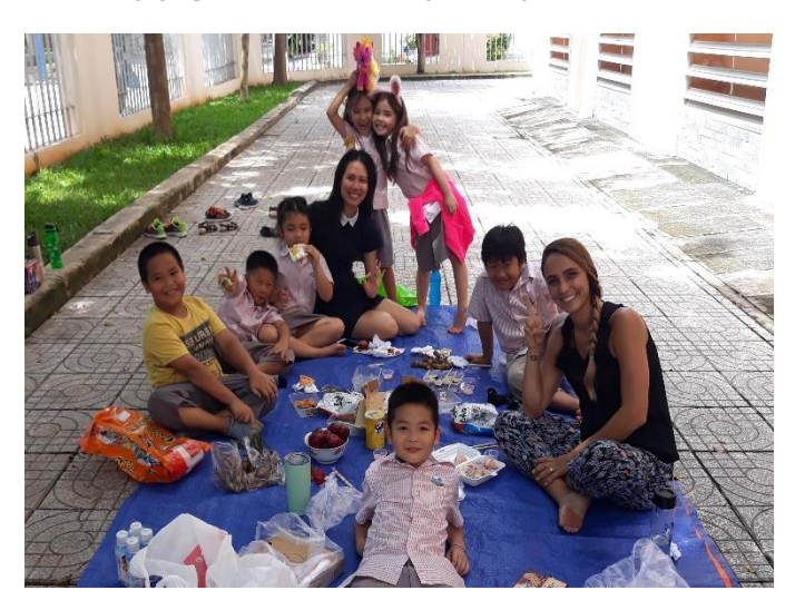
Above: Year 1 and 2 International enjoying their picnic