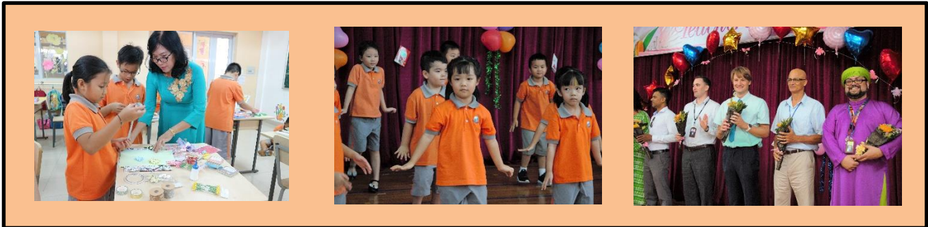
Above: Teachers’ Day Below: Halloween Stem day activities