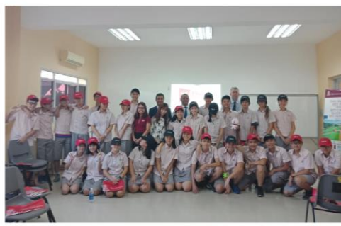
Our older students enjoying a visit from Troy University