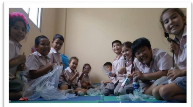
Year 1 & 2 International Eco-Bricking