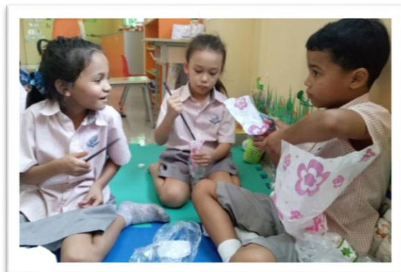
Learn more about Eco-Bricks in this newsletter.