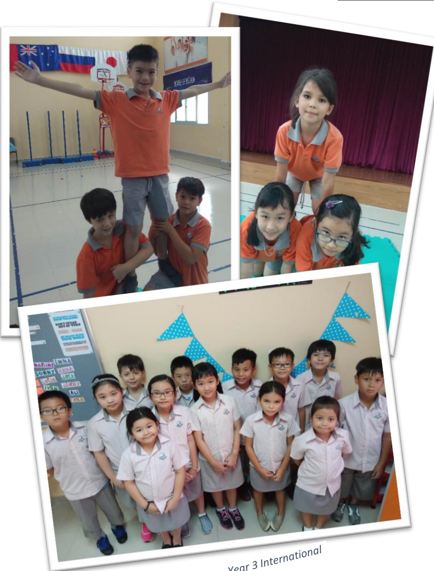
Year 3 International

In Physical Education they have also been working group balances in which the students have learnt to make small human pyramids. This has been a lot of hard work getting the balance right and their effort has really paid off!